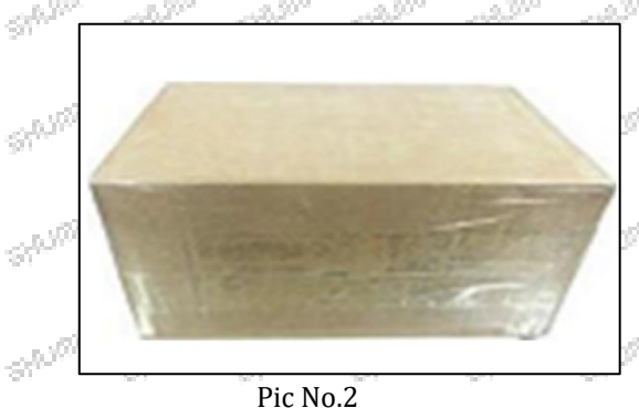
Domestic express packaging: Wrapped by Transparent tape

Minors are prohibited from using transparent tape, yellow tape, black wrapping protective film, and white wrapping protective film to avoid personal injury.